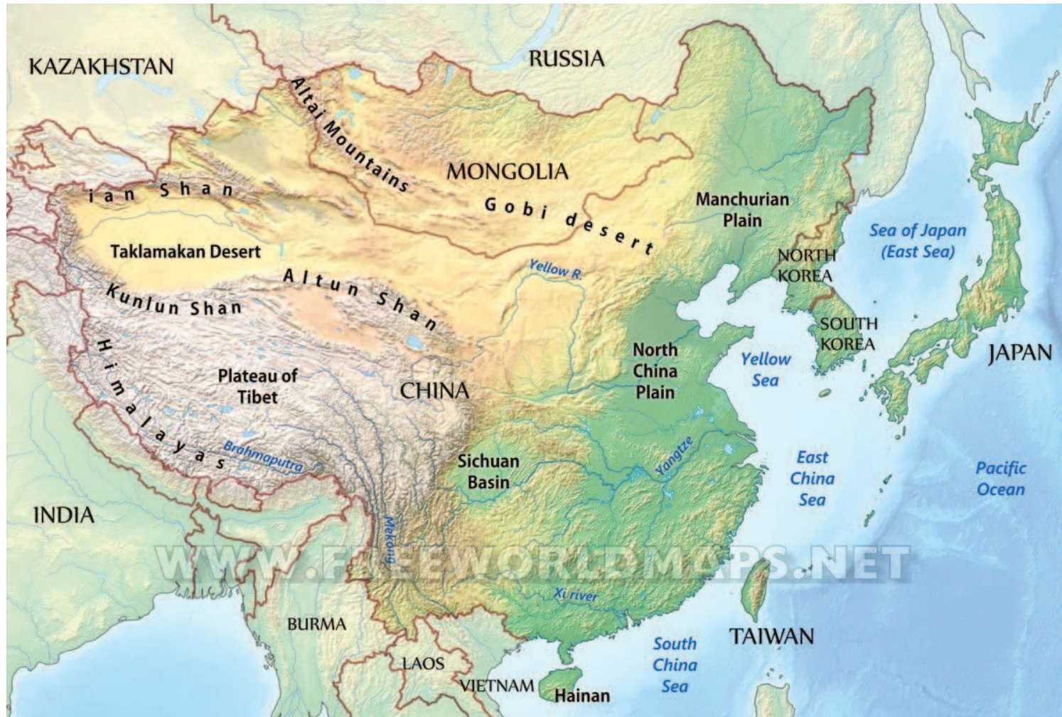
Physical Map of East Asia.