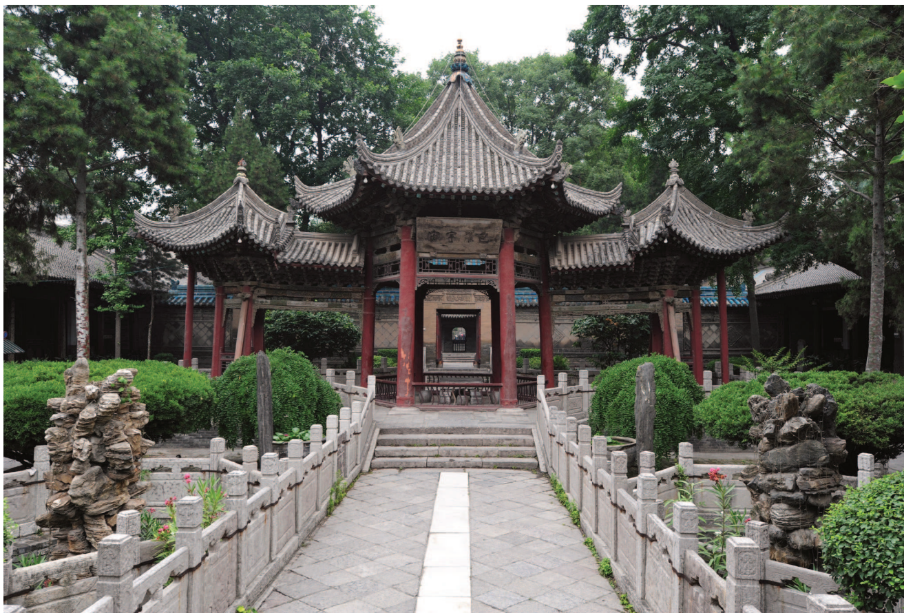
The Great Mosque of Xi'an, one of the oldest, largest, and best-preserved mosques in China, built during the Tang dynasty.