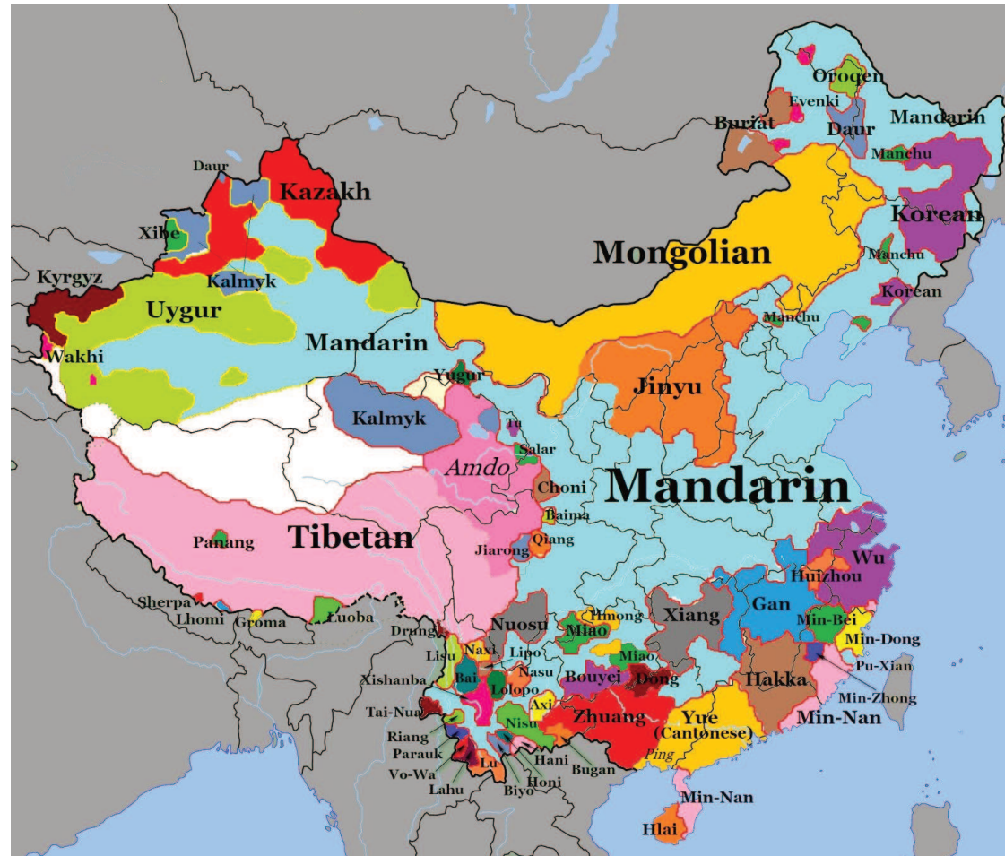
China Linguistic Map. Image by Vivid Maps © Alex Egoshin. Used with permission.

An ethnolinguistic map of China shows peoples and language groups. Each label on this map represents a different ethnic or language group in China today.