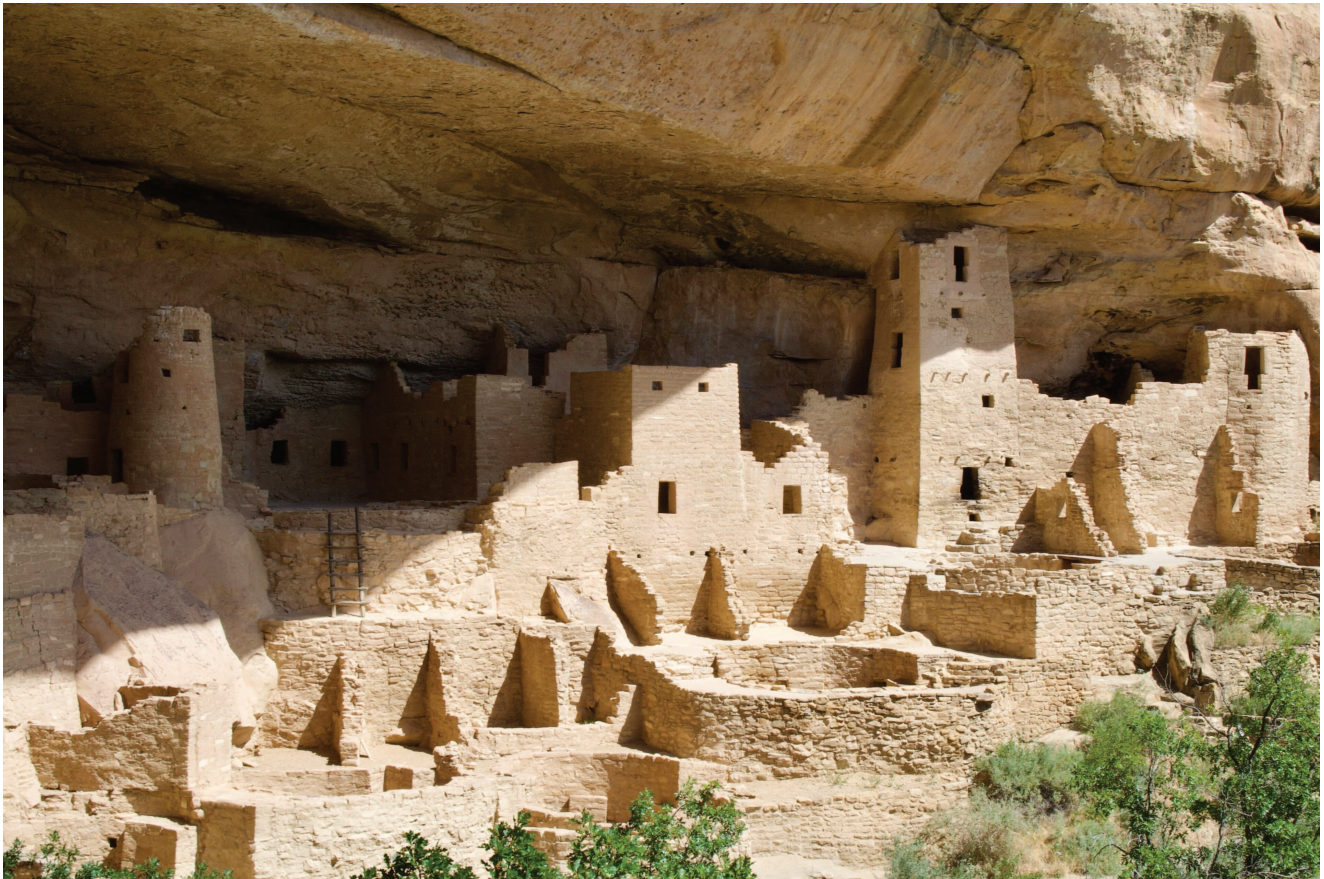
The ancestral Pueblo peoples built dwellings out of sandstone in natural cliff alcoves in the Southwest between 1150 and 1200 CE.